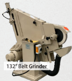
132" Belt Grinder

Rough grinding, polishing, and/or buffing are all possible with our various equipment offerings in this segment. Options include fixed or variable speed in multiple HP's, single or dual spindles, belt or buff only, or a combination thereof. Manual and fully automated configurations, including robotics.