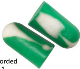
Uncorded BSF-1 200 Pair/Box