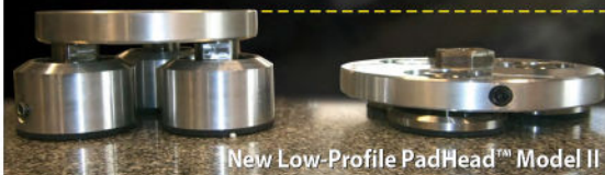
New Low-Profile PadHead™ Model II

Versatile. Revolutionary. The only head on the market using The Resistance of Friction principle.